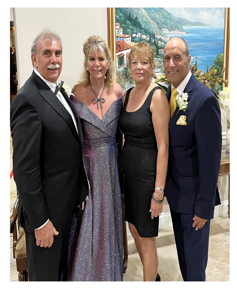
THE PRESIDENT AND VICE PRESIDENT AND THEIR BETTER HAVLES