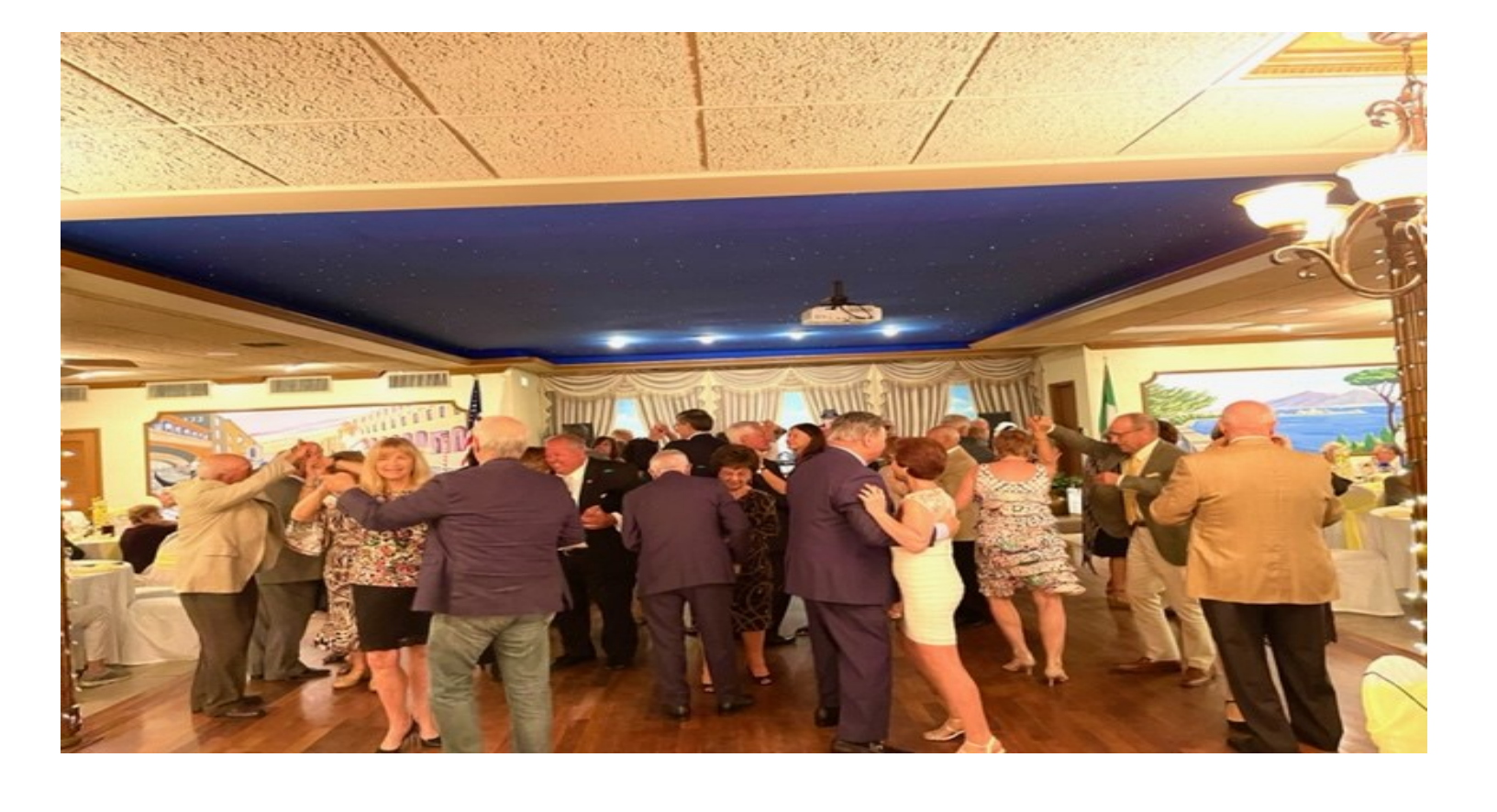
DANCING THE NIGHT AWAY